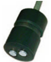
The salt measuring probe

The Salto incorporates a 5 hour delay to allow freshly added salt to dissolve and produce the correct strength of brine. During the process the LED will automatically switch from RED to AMBER and then GREEN. If the salt concentration has not increased during this period the LED will stay at red and operate the alarm relay.